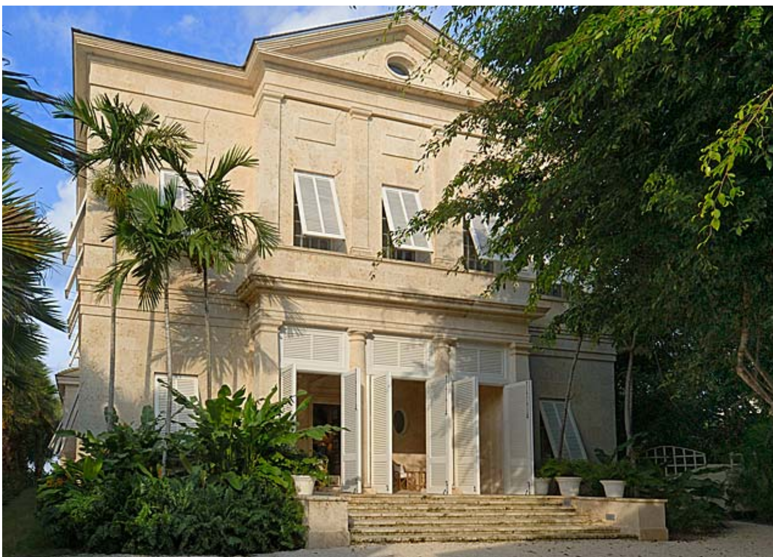
Ca' Liza , DLGV Architects and Urbanists, Nassau The Bahamas, 2010