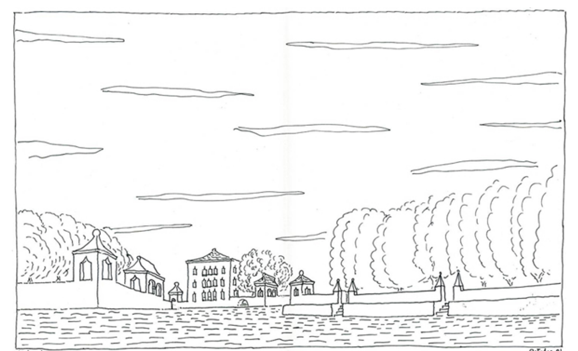
Master Plan , Old Fort Bay, DLGV Architects and Urbanists, Nassau, The Bahamas, 2000