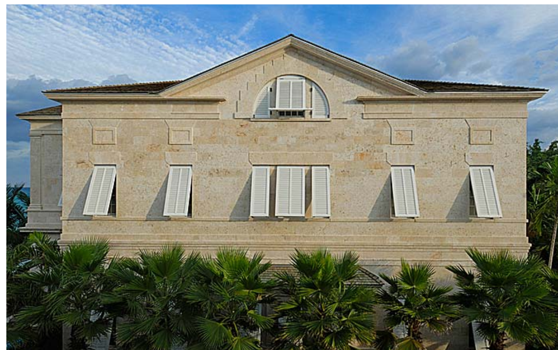
Ca' Liza , DLGV Architects and Urbanists, Nassau, The Bahamas, 2010