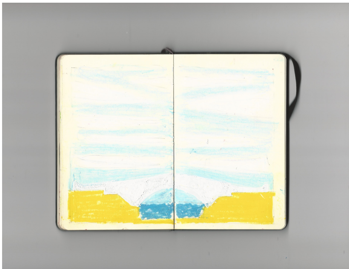
Norman's Cay Bridge , DLGV Architects and Urbanists, The Bahamas