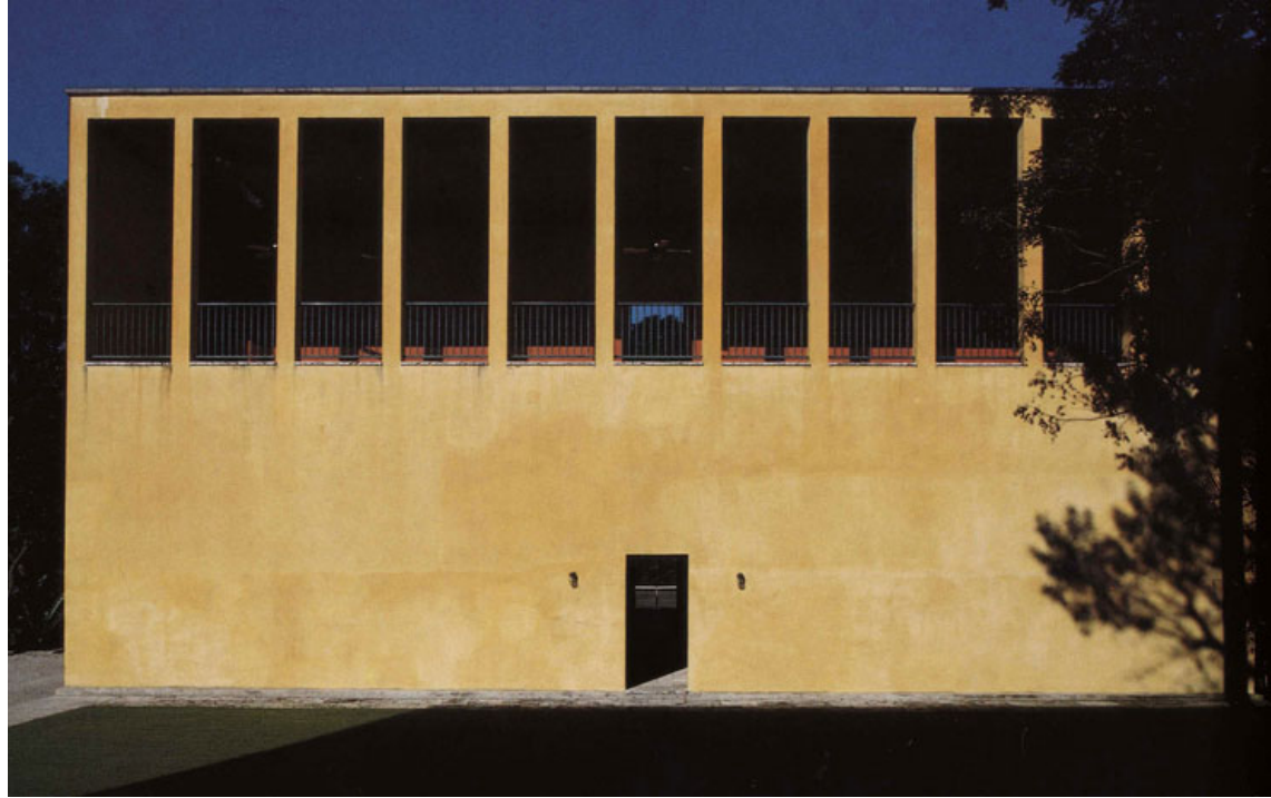
Ca' Ziff , DLGV Architects and Urbanist, Miami, Fl., 1990 -2016

At the SoA, he chairs the Classical and Traditional Architecture Committee, is the coordinator of the Master of Science in Classical and Traditional Architecture and coordinates the Open City Studio.