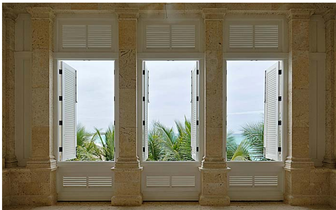
Ca' Liza , DLGV Architects and Urbanists, Nassau, The Bahamas, 2010