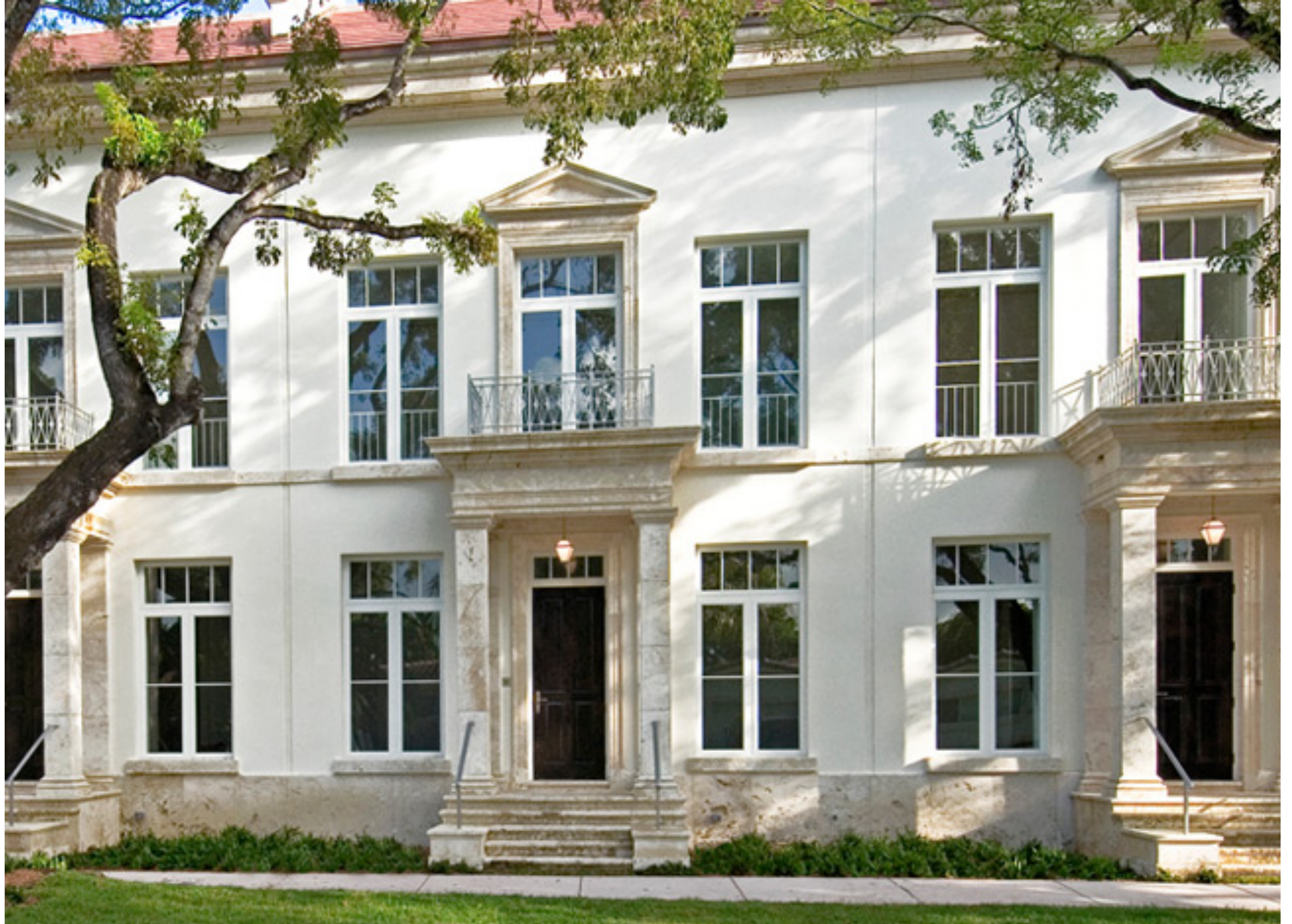
Almeria Row , DLGV Architects and Urbanists, Multifamily, Coral Gables, Fl. 2012